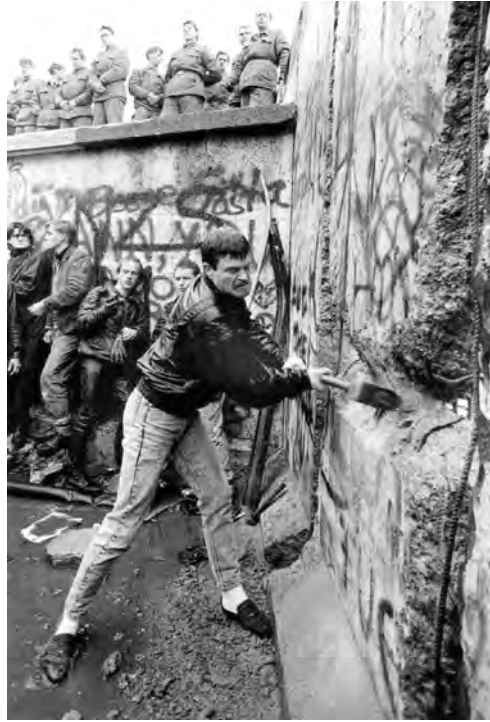
A photograph of events at the Berlin Wall in November 1989.